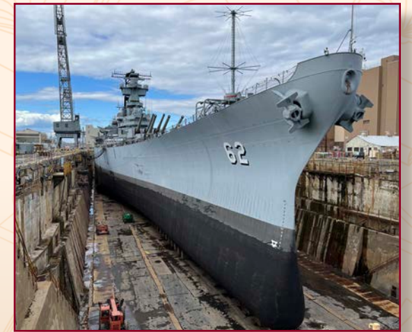
Battleship New Jersey Dry Dock

On March 21, 2024 the Battleship departed the Pat Jones/John Matheussen pier for historic dry dock preventive maintenance for the first time in over 30 years. The ship was guided by tugboats to the Philadelphia Naval Shipyard, in Dock #3, the same dock she was launched from on December 7, 1942. The Battleship remained in dry dock for 78 days and returned to her home port on June 20, 2024. While in dry dock, Trust staff got a unique opportunity to witness the ship out of the water which allowed them to walk around the exterior hull, observe the restoration work, and learn about the history and significance of the vessel. Funds from the Preserve New Jersey Historic Preservation Fund helped support the restoration.