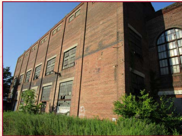
Elmer Street Boiler and Engine Room (Exterior)