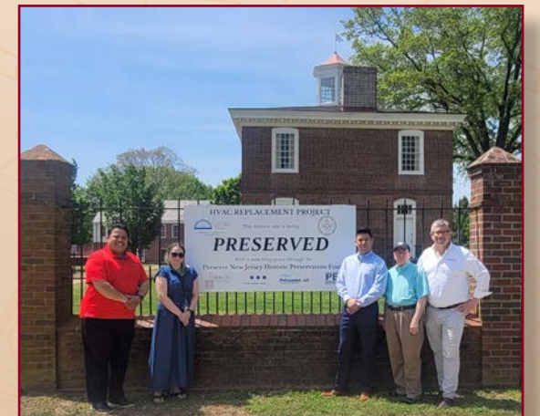
William Trent House

The Historic Preservation Continuing Education Program at Rutgers University-Camden was launched in 2016 through a partnership between the New Jersey Historic Trust and the Mid-Atlantic Regional Center for the Humanities (MARCH). Designed for those who desire to gain a deeper understanding of the vocabulary and discipline of historic preservation, students learn from professionals working in the field to gain a more realistic perspective on how the tangible remains of our past can be integrated within current environments. In 2017, the program began offering a Certificate in Historic Preservation, and in 2023 the program presented two full semesters of courses. For more information, visit: www.preservation.rutgers.edu .