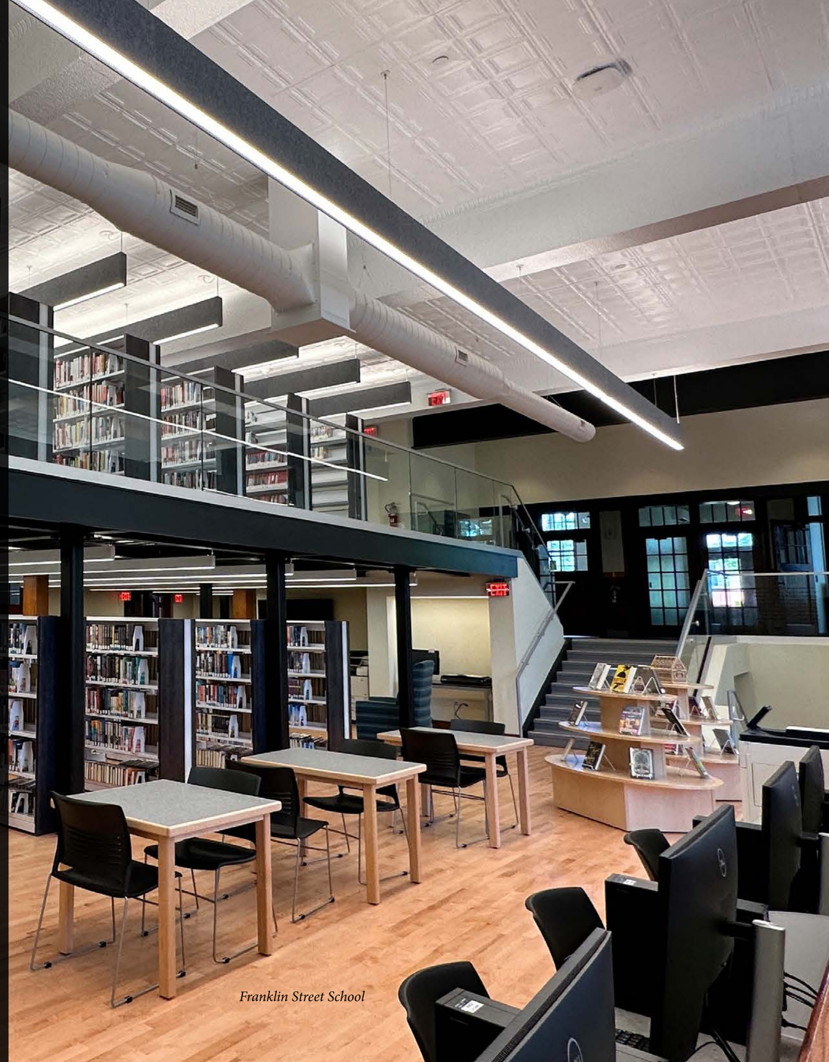
Franklin Street School