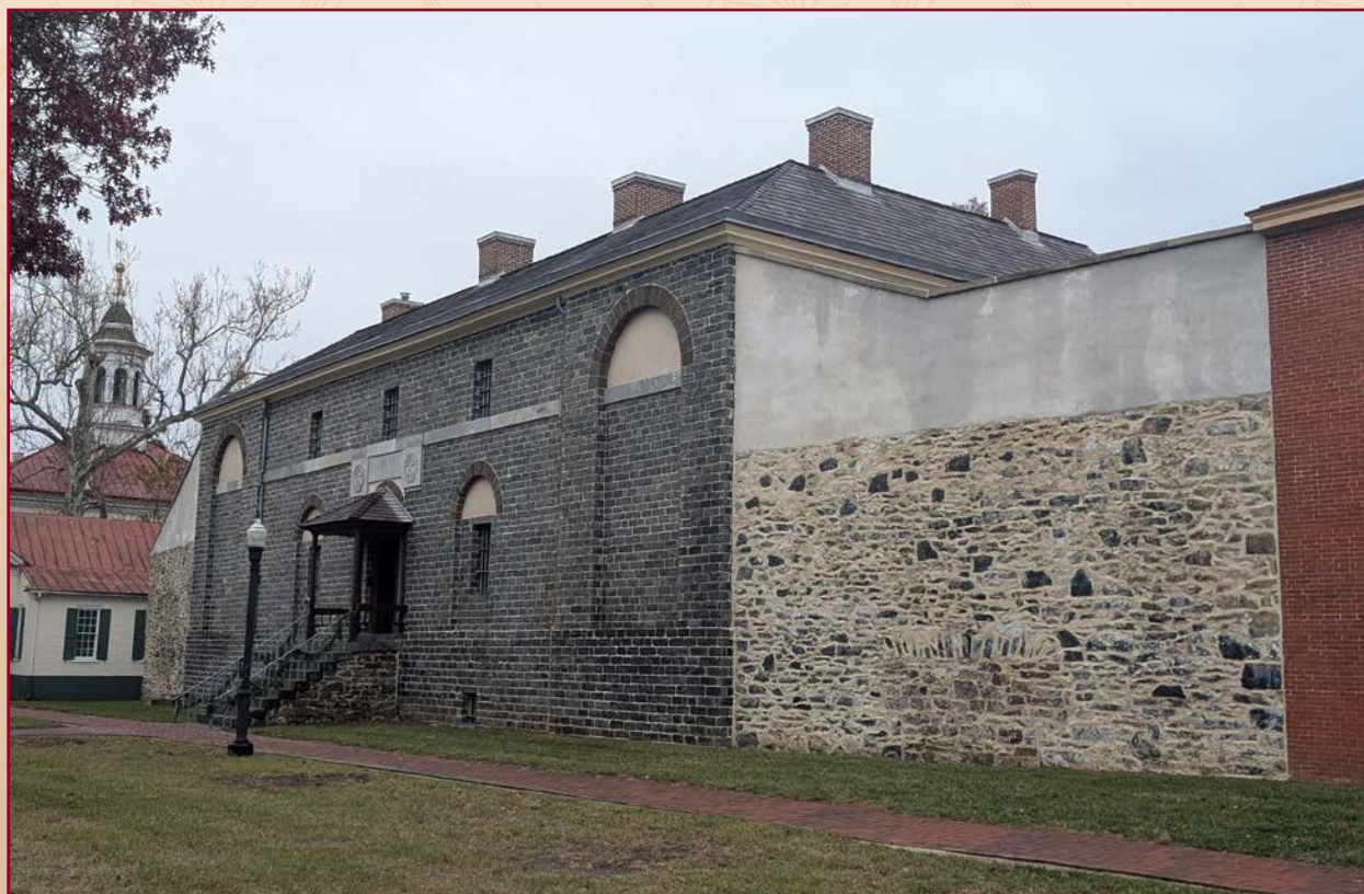
Burlington County Prison