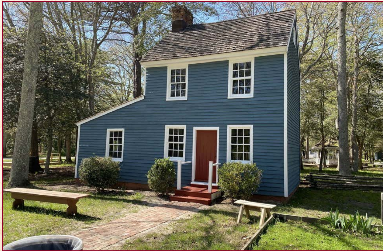
Historic Cold Spring Village Historic District