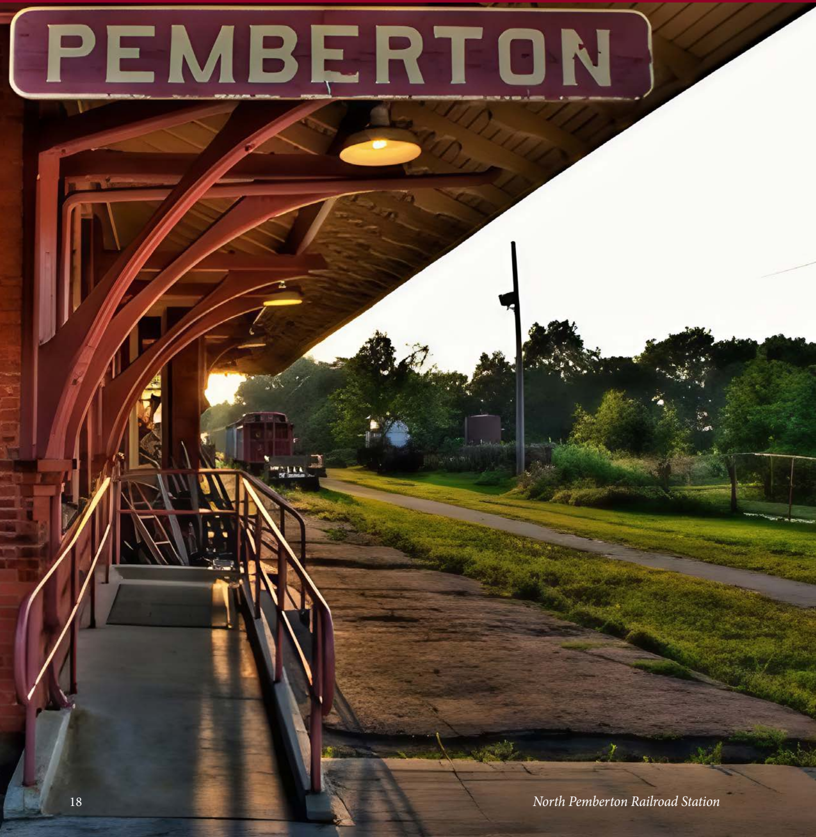
North Pemberton Railroad Station

The Discover NJ History License Plate Fund provides grants (up to $5,000) to develop and promote visitor-ready sites as heritage tourism destinations. The Fund was established at the recommendation of the 2010 Heritage Tourism Master Plan for New Jersey. Since 2012, 58 projects have been awarded for a total of $243,650. The following grant awards were made in 2024: