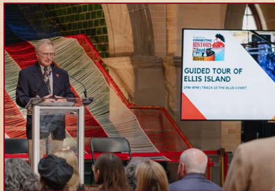
History and Historic Preservation Conference

The History and Historic Preservation Conference: To and From: Connecting History by Road, Rail, & River was held at New Jersey City University in Jersey City on June 5 and 6. It was an exciting two-day event that included a half-day workshop on placemaking and storytelling; tours of Ellis Island, the Hudson River (on a historic schooner!), Loews Jersey Theatre, and a bus tour exploring Jersey City landmarks and historic districts ; an opening reception at the Central Railroad of New Jersey Terminal; 14 classroom sessions and six lightning sessions; a dynamic keynote speaker; and a closing reception highlighting the historic Margaret Williams Theatre at Jersey City University. To and From: Connecting History by Road, Rail, & River received generous financial support from over 40 sponsors, many of whom were showcased in the marketplace on the day of the conference.