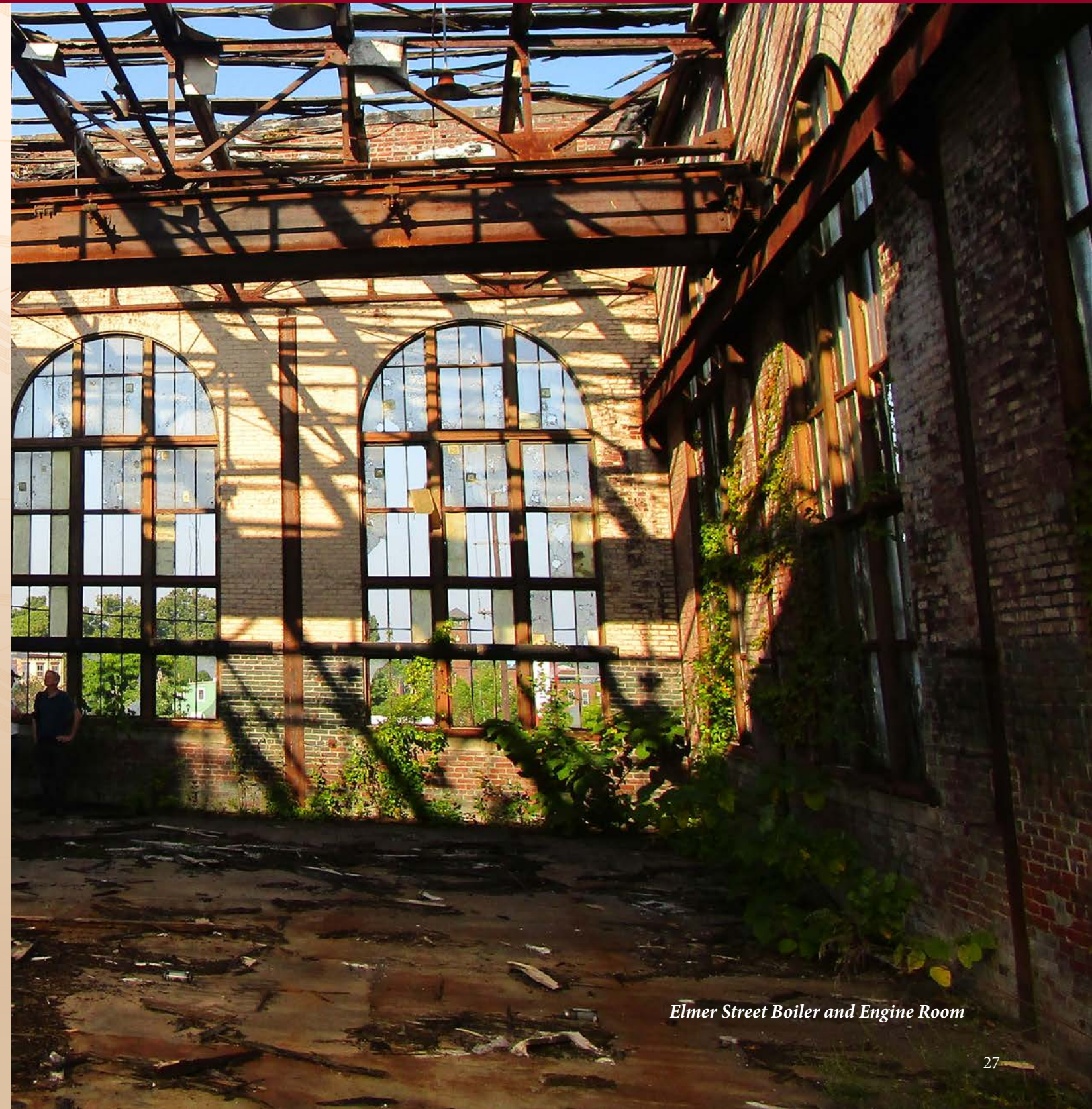
Elmer Street Boiler and Engine Room

The Elmer Street Boiler and Engine Room have been vacant for more than two decades. Plans are currently underway to transfer ownership from the Mercer County Improvement Authority to a private developer who will rehabilitate both the Boiler House and Engine Room for new uses.