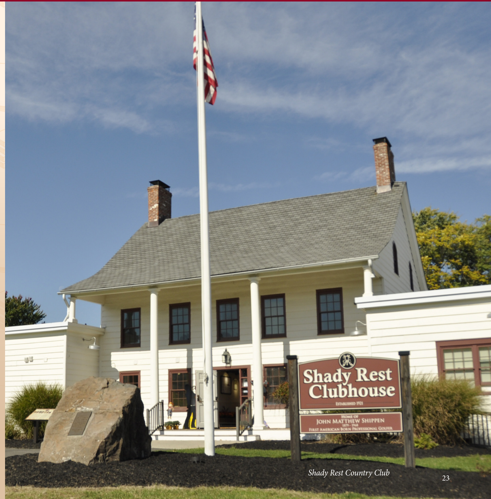
Shady Rest Country Club

We look forward to keeping the momentum going and to exciting developments in the year ahead! To plan your journey, visit journeythroughjersey.com for more information.