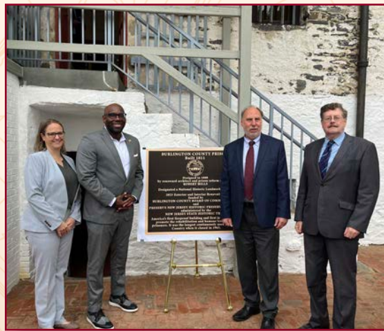
Burlington County Prison Museum

Throughout the year, the New Jersey Historic Trust staff helps plan and supports educational workshops and conferences that reached the history and historic preservation audiences. In 2024, the Trust participated in several events including the New Jersey Governor's Conference on Housing and Economic Development, New Jersey Conference on Tourism, New Jersey League of Municipalities Conference, Middlesex County History Day, and Washington's Landing. In addition, New Jersey Historic Trust staff and board members regularly attend events that celebrated a project's milestones, such as a ribbon cuttings or groundbreakings. This year, the Trust celebrated ribbon cutting and groundbreaking ceremonies at the Burlington County Prison Museum, Craftsman Farms, and Franklin Street School.