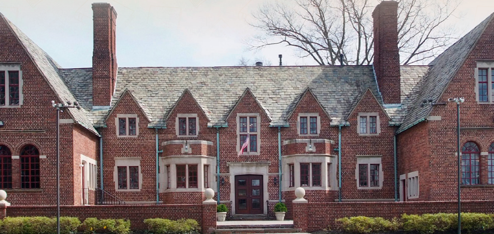
Moorestown Community House

Four categories of grants are awarded through the program. Historic Site Management; Municipal, County, and Regional Planning; and Heritage Tourism Grants, up to $75,000, help support planning exercises that promote effective management and interpretation at historic sites. Capital Preservation Grants, up to $750,000, help support construction expenses related to the preservation, restoration, and rehabilitation of historic properties and associated architectural and engineering expenses. In 2024, over $6 million was reimbursed for construction and planning activities. The following projects were successfully completed and closed out in 2024: